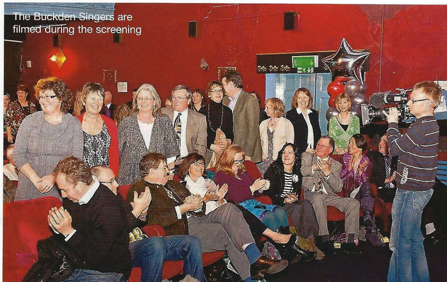
The Buckden Singers are filmed during the screening